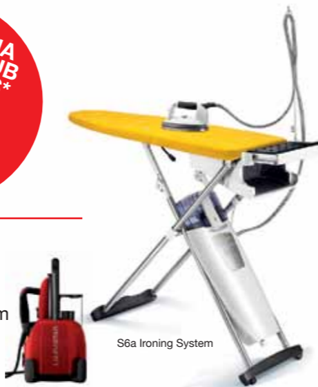
S6a Ironing System

AKARANA GOLF CLUB MEMBERS* SAVE 10% OFF REGULAR PRICES ON STEAM STATIONS & IRONING SYSTEMS. JOIN US FOR A DEMONSTRATION